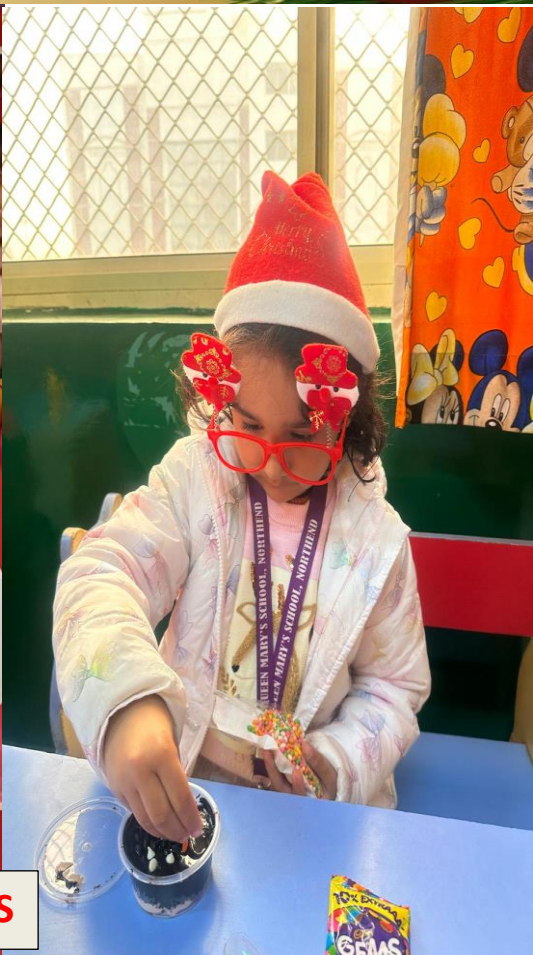
JOYFUL CHRISTMAS ACTIVITIES